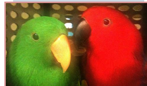
The first two Babies; Eago Baby and Zazu Bear - she's laying eggs now....